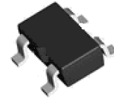
Package (SOT-143) Marking " CDA4 "