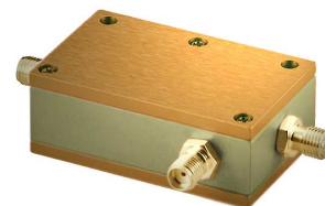
CASE STYLE: FM587 PRICE: $49.95 ea. QTY (1-9)