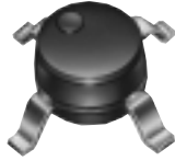
CASE STYLE: RRR137