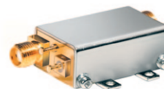
Case Style: GA955