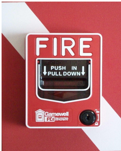
Figure 1 NYC-Plate

The NYC-Plate provides the backplate for the manual pull station. (See Figure 1).