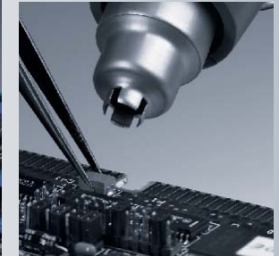
Ideal for de-soldering electronic components

Targeted illumination for enhanced precision