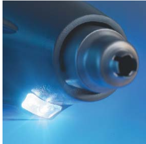
LED light provides bright illumination of the work area and also serves as a convenient "on" indicator