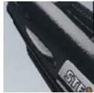
Molded safety rests