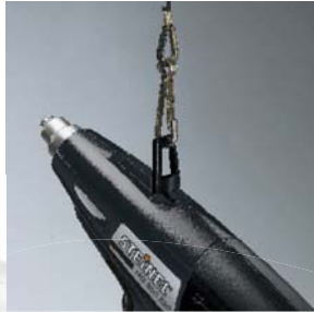
Integral security hanger for safety and convenience