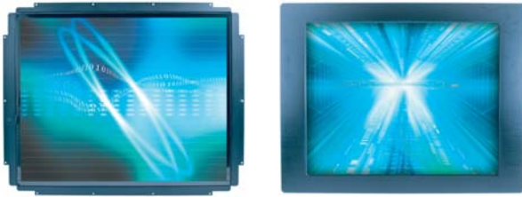
Open Frame Type