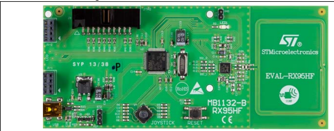
Figure 1. EVAL-RX95HF RF transceiver board alone