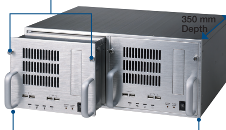
Dual Nodes Design

Thumb Screws to Fix The Sub-System in the Cage