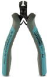
ESD electronic front cutter, without chamfer, with opening spring

Please be informed that the data shown in this PDF Document is generated from our Online Catalog. Please find the complete data in the user's documentation. Our General Terms of Use for Downloads are valid ( http://download.phoenixcontact.com )