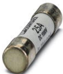
Fuse, 10.3x38 mm, up to 1000 V DC, gPV characteristics

Please be informed that the data shown in this PDF Document is generated from our Online Catalog. Please find the complete data in the user's documentation. Our General Terms of Use for Downloads are valid ( http://phoenixcontact.com/download )