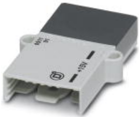
SmartWire DT™ bus termination plug

Please be informed that the data shown in this PDF Document is generated from our Online Catalog. Please find the complete data in the user's documentation. Our General Terms of Use for Downloads are valid ( http://phoenixcontact.com/download )