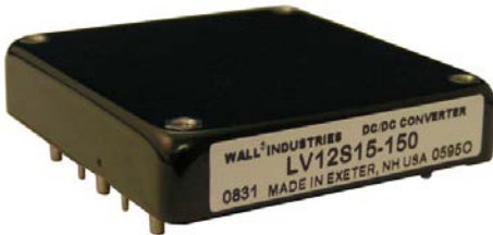
Size: 2.28in x 2.4in x 0.50in (57.9mm x 61mm x 12.7mm)